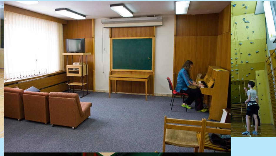
(club-room of the dormitory)